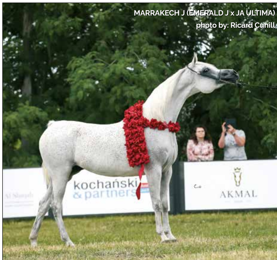
MARRAKECH J (EMERALD J x JA ULTIMA)

When reflecting on the foundational mares of Jadem Arabians, one cannot overlook the exceptional Elegantkah (Gwizd - Eminencja by Algomej). Foaled in 1994 and tracing back to the esteemed Wotoszka dam line, this