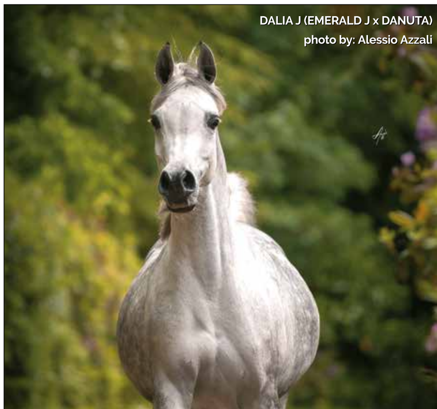
DALIA J (EMERALD J x DANUTA)

Champion Junior Filly. In 2015, Dalia J made her mark by securing the title of Silver Champion Junior Filly in Deauville, followed by a sweep of top honors as Gold Champion Junior Filly and Best in Show at the Arabian Horse Weekend. The most decorated among them, Dana J, has amassed an impressive list of accolades, including Silver Champion Junior Filly in Ströhen (2018), Gold Champion Yearling Filly at the Al Khalediah European Arabian Horse Festival (2018), Gold Champion Yearling Filly and Best in Show at the 2018 Arabian Horse Weekend, and Bronze Champion Junior Filly at the 2020 European Championships in Prague. Continuing her success in the senior division, Dana J was named Belgian National Bronze Champion Mare in 2023.