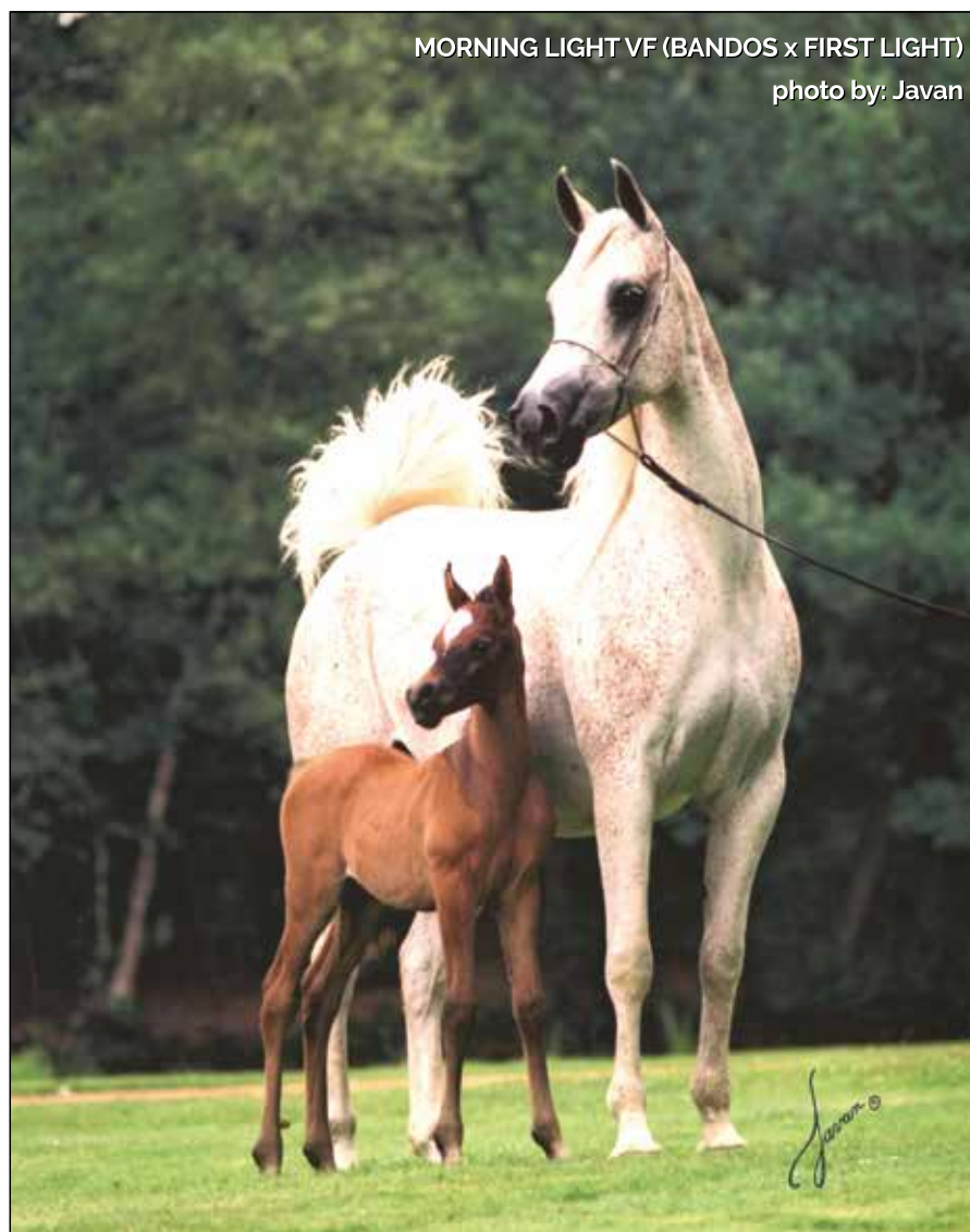
MORNING LIGHT VF (BANDOS x FIRST LIGHT)

Among the early foundation mares were individuals whose names continue to resonate profoundly within the legacy of Jadem Arabians - mares whose influence is evident in the vast majority of the horses currently at the stud as well as other prominent breeding programmes around the world. Their unwavering capacity to produce progeny of exceptional quality has secured their continuing